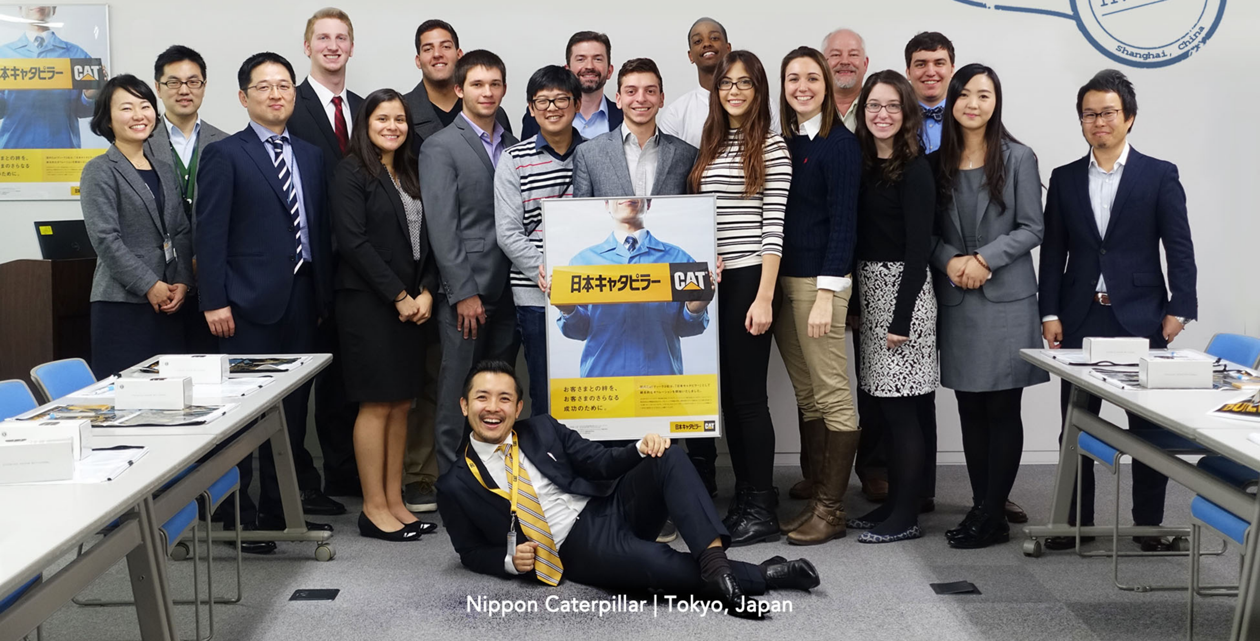
Nippon Caterpillar | Tokyo, Japan